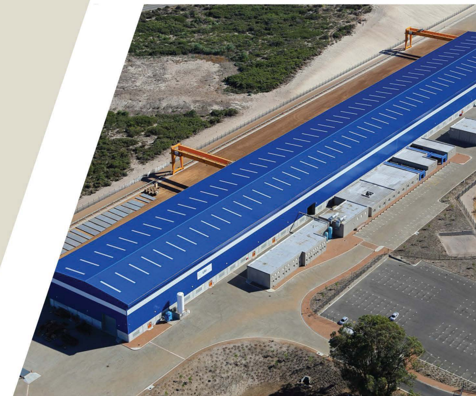
GRI Wind, Atlantis, Western Cape

SRI is calculated using ASTM E1980-01 with Medium Convection Coefficient (12) value reported. This data is approximate values only, may vary based on paint formulation and/or metallic coating thickness. The colours shown in the colour chart have been reproduced to represent actual product colours as accurately as possible. However, we recommend you to check your chosen colour against actual sample of the product before purchasing, as varying light conditions and limitations of the printing process may affect colour tones.