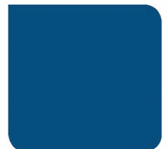
African Blue (SRI:27)