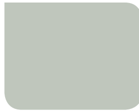
Aegean Green (SRI:59)