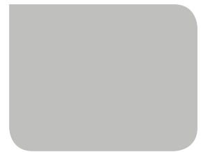
Silver Coin (SRI:58)