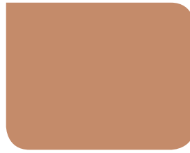
Copper Penny (SRI:54)

Offering you a vibrant selection of colours to match your most prestigious designs.