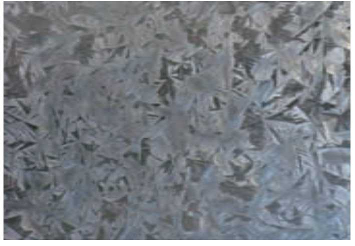
The distinctive "spangle" pattern of galvanised steel