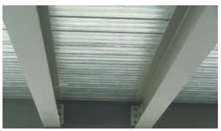
Galvanised steel decking

A. Galvanised steel is produced in a range of coating classes — traditionally the most common coating class for roofing and walling in the western world has been Z275 — based on considerations of cost, performance