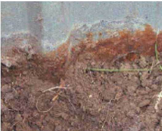
Figure 3 - Corrosion due to immersion in soil.

The build-up of grass cuttings, leaves, soil from gardens, mulch, compost, sand, ashes or similar must be avoided. Failure to prevent this build-up will cause premature corrosion of ZINCALUME® steel and COLORBOND® steel. This occurs as a direct result of corrosion mechanisms associated with the wet poultice held against the coated steel surface. Please refer to Figure 3.