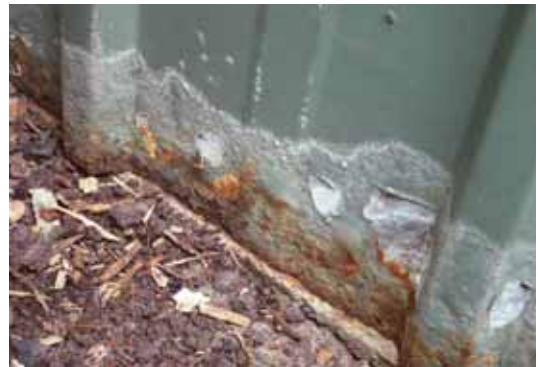
Figure 2 – Corrosion due to inappropriate wall design.

metallic products will contribute to this mechanism when installed incorrectly. Please refer to Figure 2.